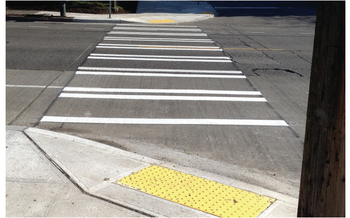
New and upgraded curb ramps at many intersections along N 50th St.

For details on these other segments, please visit our webpage.