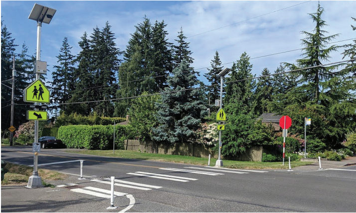
N 50th St will soon have rapid flashing beacons at Dayton Ave N and at Woodland Park Ave N.