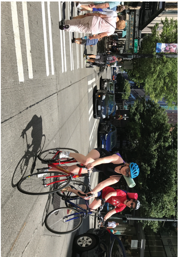
Thousands of people are already biking in downtown Seattle, even without separate bike lanes, like here at Pine St and 6th Ave.

We've started talking with Pike-Pine corridor stakeholders. Reach out today to get on our contact list, schedule a meeting to discuss your building or business needs, and ask questions.