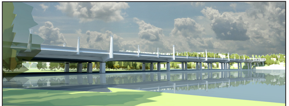
Rendering of a new Portage Bay Bridge, with new HOV lanes and an extension of SR 520's regional bicycle/pedestrian path.