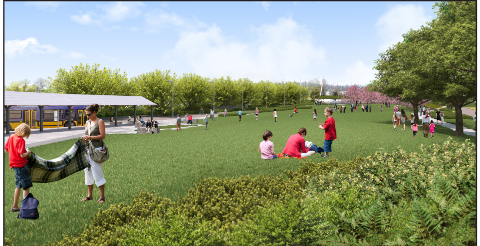
Rendering of a new Montlake lid, with connections to regional bus routes and local bicycle/pedestrian paths.