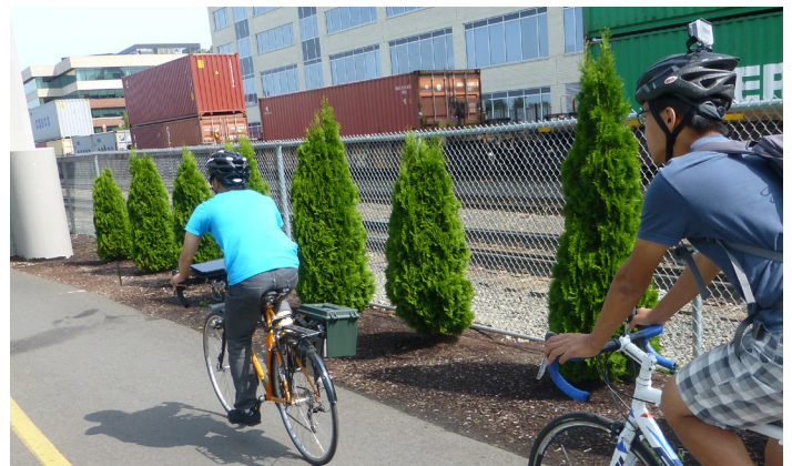
Project team collecting trail conditions via a specially equipped bicycle

Seattle's multi-use trails are an essential part of the city's transportation network. They provide convenient access to neighborhoods, parks, schools, shopping areas and employment centers for all ages and abilities. That is why it is important to make our trails the best they can be.